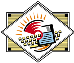
Business, Management Marketing & Technology